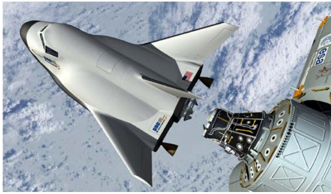
The Dream Chaser , built by SpaceDev, is designed to carry seven people back and forth to the ISS.

In 2010, NASA asked commercial companies to design spacecraft to move people back and forth to space stations. These ships would need to be able to carry seven astronauts to the ISS. Then they would need to stay docked for up to 210 days before flying back to Earth and landing safely.