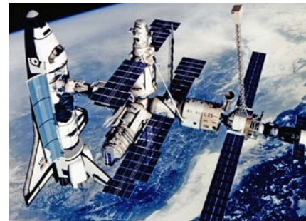
An artist's drawing shows how the space shuttle Atlantis docked with the Russian Mir space station in 1995.

Since the first crew entered the ISS on November 2, 2000, it has never been empty.