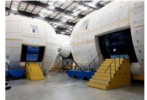
Life-sized models of Bigelow Aerospace’s inflatable space habitats.

company—Bigelow Aerospace—is working to make space hotels a reality. Bigelow is creating a “balloon habitat.” The habitat folds up into a rocket’s cargo area and expands when it is placed into orbit. The company is working on a unit that will house six people in a space similar in size to the ISS.