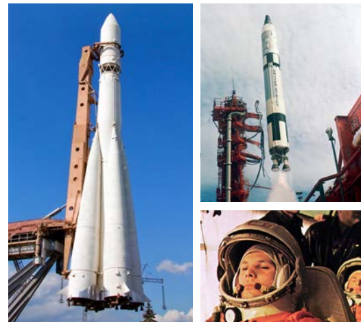
Yuri Gagarin (bottom right) became the first person to travel into space when he orbited Earth aboard a Vostok rocket (left) on April 12, 1961. The Gemini-Titan rocket (top right) helped the United States prepare to send astronauts to the Moon.

Many people were sad to see the shuttle program end. NASA was getting out of the business of carrying people and things back and forth between Earth and space in order to focus on space science and exploration. The agency also planned new missions to send robotic rovers and people to exciting destinations such as Mars. For the first time, NASA made the decision to turn over the more common types of missions to commercial companies.