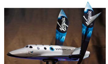
A model of SpaceShipTwo shows the wings in the tilted position.

In October 2014, one pilot died when SpaceShipTwo crashed in California during a test flight, which reminded everyone of the risks involved with the new technology. The company plans to continue working toward safe commercial spaceflight.