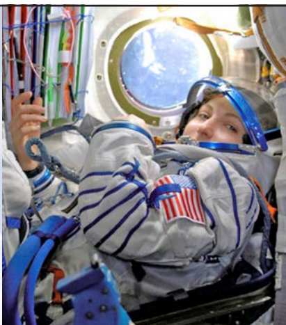
Anousheh Ansari on the ISS in 2006

Mr. Tito spent eight days aboard the ISS before returning to Earth. Following his flight, several other private citizens have each paid $20 million to $35 million to make similar trips to space. Among them were famous computer game designer Richard Garriott, and Iranian-American businesswoman Anousheh Ansari, whose family the Ansari X-Prize was named after.