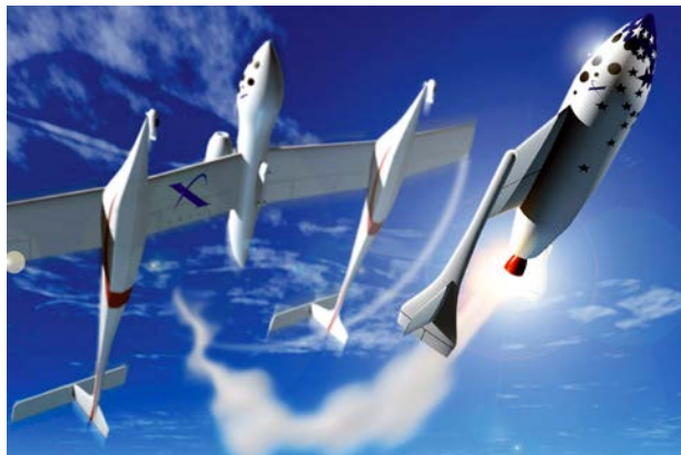
An artist's drawing shows SpaceShipOne 's rocket engine igniting seconds after release from its mothership, WhiteKnight .

SpaceShipTwo is the spaceplane that Virgin Galactic will use to carry paying tourists into space. It has its own mothership, WhiteKnightTwo , and uses a design that is similar to SpaceShipOne , though it is larger. Like SpaceShipOne , it is designed to fly to the edge of space and back. Passengers on board SpaceShipTwo will experience about six minutes of weightlessness before returning home.