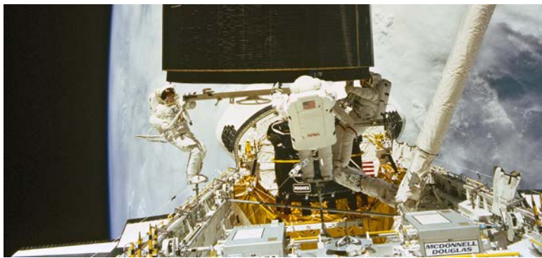
Three NASA astronauts grab a malfunctioning satellite during a spacewalk outside the space shuttle Endeavour on May 7, 1992.

By 2011, the space shuttles were getting old, but that wasn't the only reason NASA stopped using them. They were also expensive to launch and difficult to maintain. The shuttles could be used to do some amazing things that no other spacecraft could do. They could grab satellites from orbit and return them safely to Earth. The tasks that NASA was using shuttles for were simply too expensive for NASA to continue.